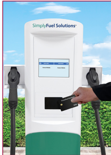
Fleet access and public EV charger purchase