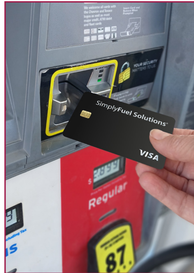
Public gas station purchase