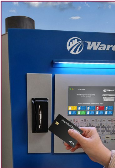
Fleet fuel site dispenser access

Provides secure access to on premiss fleet fuel, public fuel stations, and EV chargers, and allows fleet managers to customize rules and controls for each card and driver