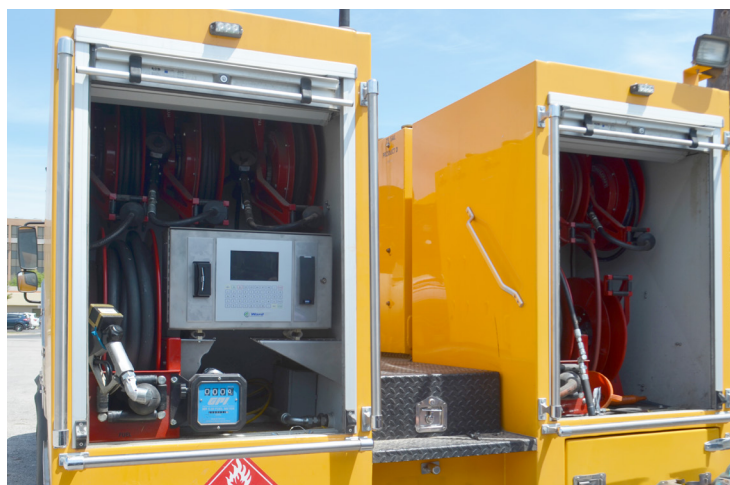
Versatile mounting location options.