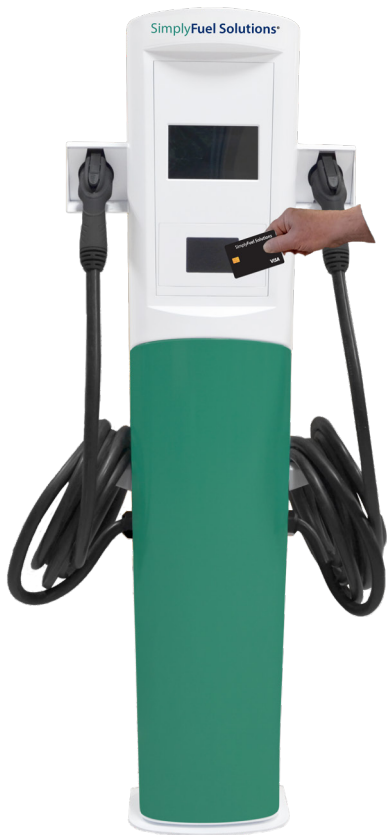
Single or Dual Charging Ports Pedestal or Wall Mount

New, faster, space-saving and cost-effective